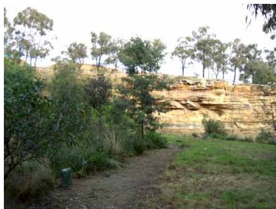
Gooseneck Meander south of Kodak bridge