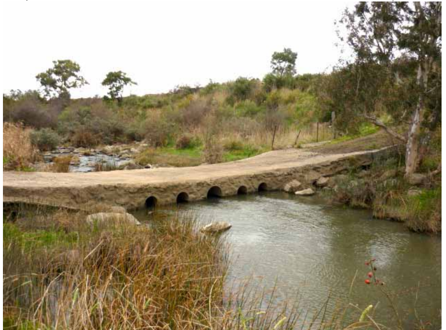
The crossing leading to Galgi Ngarrk (Craigieburn Grasslands) at O’Herns Rd Somerton

Before we get on to the big one, let’s mention the last two additions: the Goff St and Golf Course rivulets. The former comes in above Bell St, near a broad, rocky