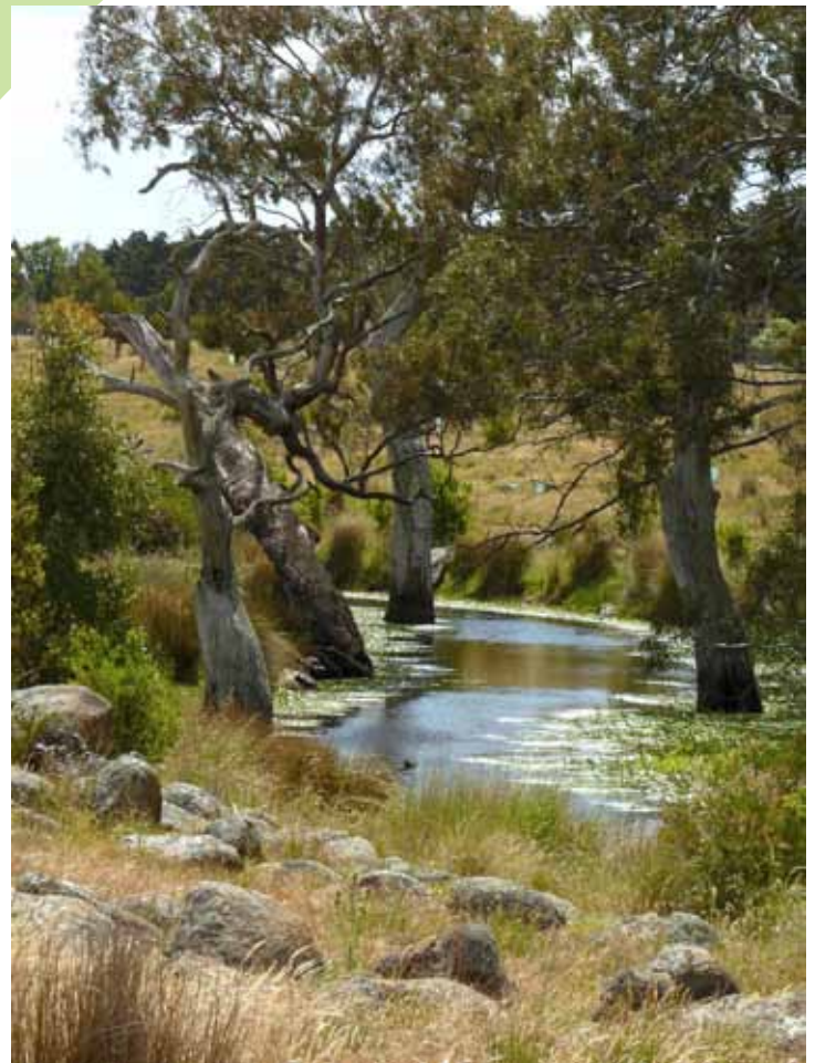
FoMC is striving to protect significant areas like this in the upper Merri.

Regardless of what happens in this flawed process, FoMC will continue to press for the best possible environmental outcome.