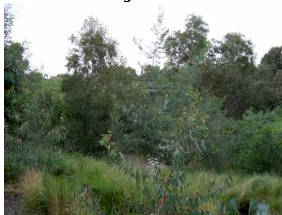
Actual Gooseneck Meander