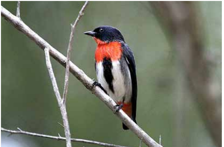
Mistletoebird