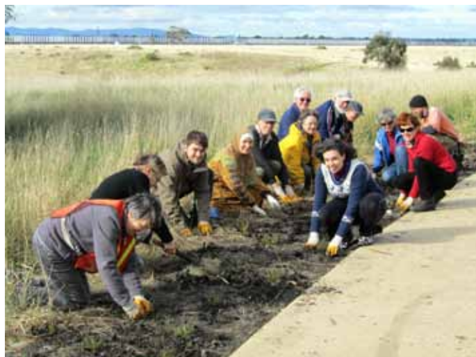
The Community Planting at Galada Tamboore on 19 May

Further information: www.parkweb.vic.gov.au