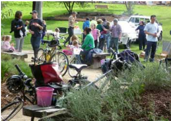
Some of the planters at Coburg Lake Contemplation Garden on World Environment Day, 5 June.

The group has worked closely with Moreland Council, which has been fantastic, to extend the planting along the Merri Creek at the Bakers Rd footbridge and at the Contemplation garden at Coburg Lake. We have also been working along the fence lines at Coburg and Coburg North Primary Schools as well as further planting at the Moreland Salvation Army site in Bakers Rd. This has