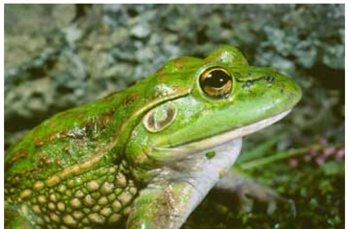
Adult female Growling Grass Frog