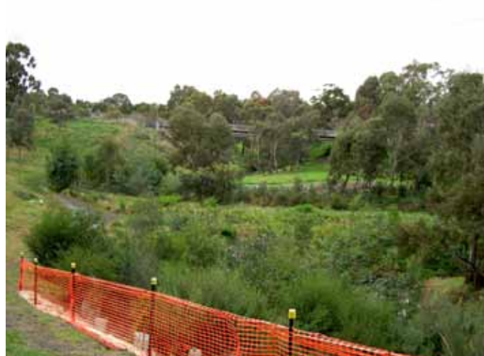
Gooseneck Meander from June 2010 about four weeks after planting (at left) and the same site in October 2011 (at right - taken from a slightly different view point.)