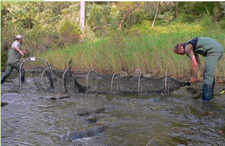
A fyke net to survey platypus in Merri Creek. Note the number of white ties which are used to repair the nets after Rakali (water rats) chew their way out.