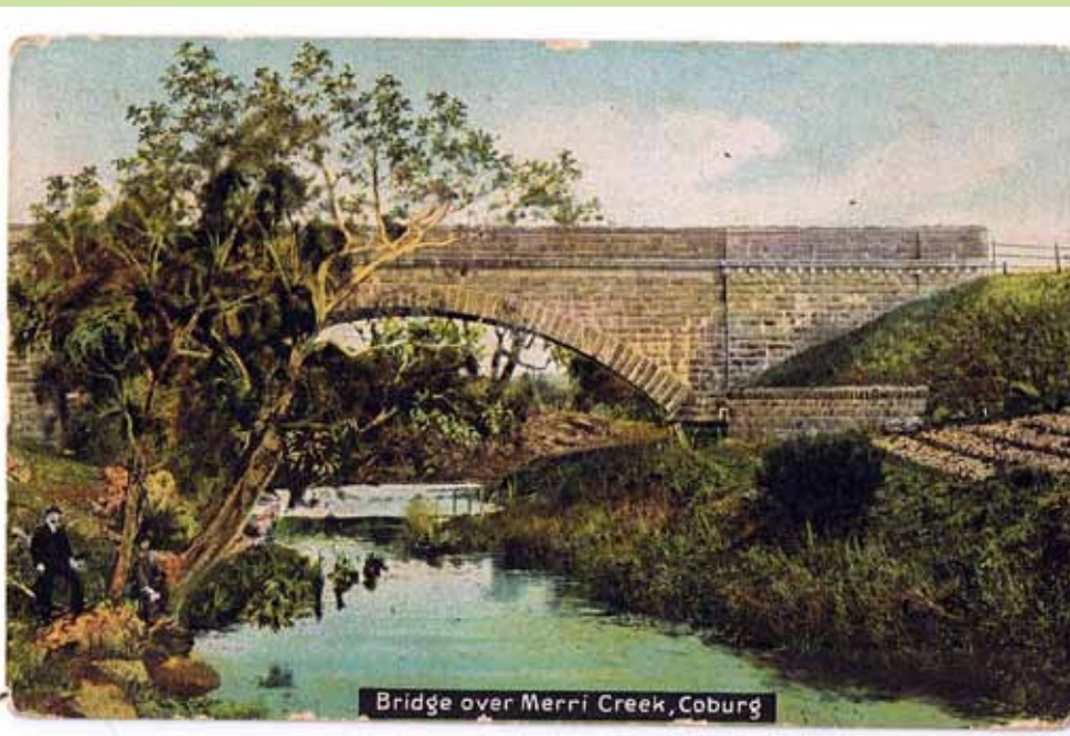
A 1908 postcard showing the bridge over Merri Creek at Murray Rd Coburg