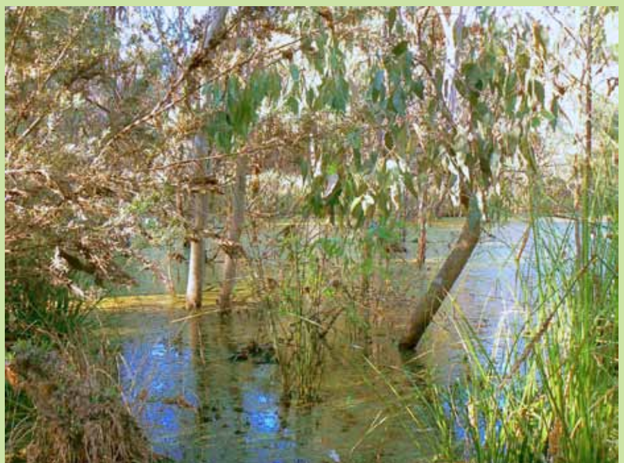
Allie Dawe took this photo of Strettle Wetland Thornbury after heavy rains in January, looking westward (towards the creek) from the eastern edge of the wetland. It may well be the wetland referred to in the Guardian article.