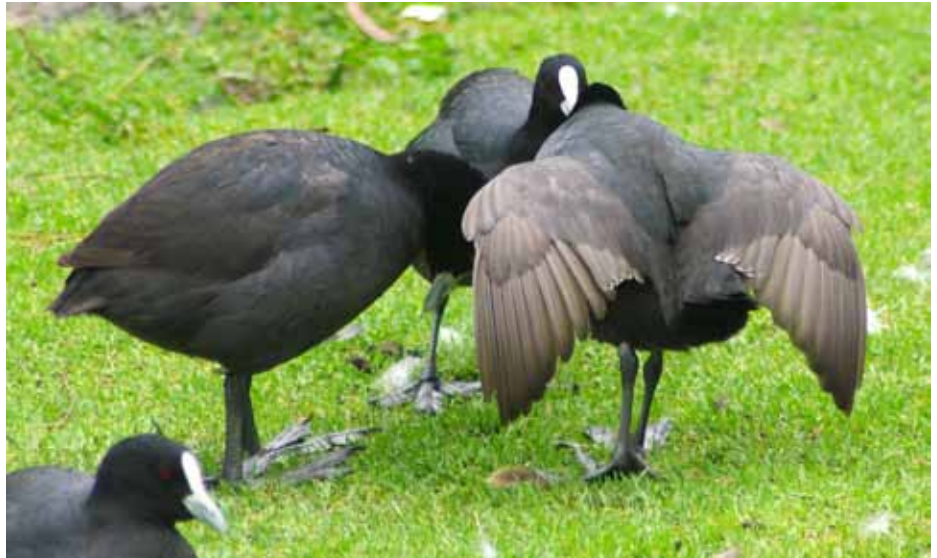
"Me too please!" One Eurasian Coot grooming another at Edwardes Lake.

Tawny Frogmouths are regularly recorded in the East Coburg survey, but this time there were two families, each with one youngster.