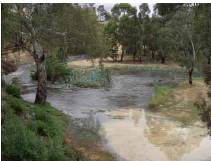
Planting by the Silurian cliff at Edgars Creek Coburg, with some "good water" from some of the first drought breaking rains in late 2009.

For some trees, it was too late. Their bare branches breach the greenness, here and there. Wattles in particular have experienced an extensive die out, their dark frames still standing resolute. Eventually they will fall, providing food and shelter for wildlife. But overall, Edgars Creek has fared well. With continuous rainfall,