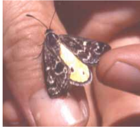
Female Golden Sun Moth. This endangered moth is threatened by development in the upper Merri, which the Government says is needed by our expanding population.

Coalition spokesman Scott Morrison, equally intent on growth, goes further by ignoring such trivia as climate change, water and food supply: he certainly doesn't propose we should all have to cut back. The Greens on the other hand are aware that overpopulation is a global problem and keen to combat it both here and elsewhere, with family-planning facilities, empowerment of women, and the development of more responsible attitudes in men.