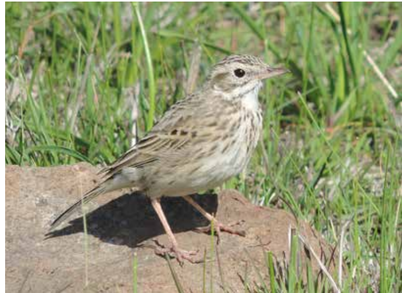
Australasian Pipit at Bababi Marning.