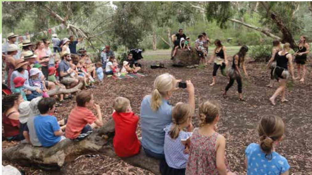
Wurundjeri dancers at the Merri Magical Morning in Merri Park Northcote on 22 February 2015.

Please note that only financial members as at Tuesday 17th November can vote at the AGM or nominate for positions. Unfortunately, we are unable to approve memberships at the AGM.