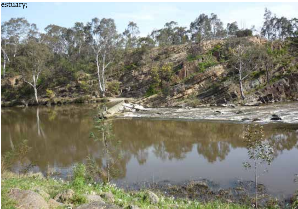
A beautiful place for reflection: the Yarra River at Dights Falls Abbotsford.