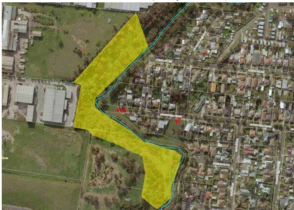
Map showing the area of woody weed removal.