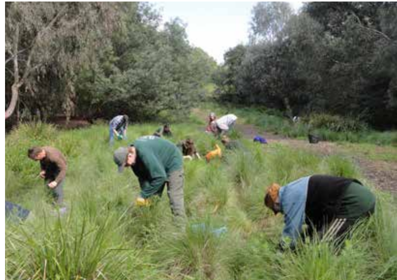
Handweeding at Merri Park Wetland on 11-9-16

New email address, but old postal address: FoMC now has a new email address: friendsofmerricreek@gmail.com to which we are slowly changing over, so please amend your records. However, after previously advising that our postal address had changed, we are remaining with PO Box 93 Moreland 3058. Apologies for any inconvenience. We have also established online banking.