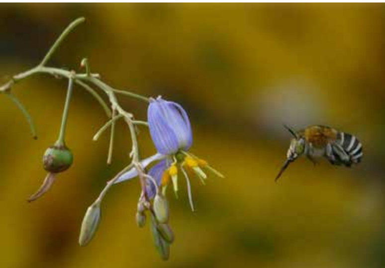
A Blue-banded Bee approaches a critically endangered Matted Flax-lily ( Dianella amoena ).