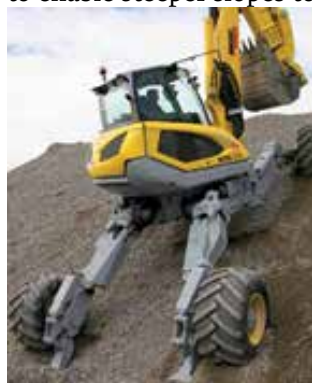
The spider-style machine that will be undertaking grooming works.

I would like to dedicate this article to a brief description of a recently announced major project that has left FoEC feeling both very excited and also validated, for its proceeding has been in part due to our work and advocacy! Melbourne Water has advised that funding has been approved to undertake removal of all of the boxthorn and woody weeds on the steep creek slope around Livingstone St (from around Tilley St to Arthur St). The plan is to groom/mulch all of the boxthorn/weeds, with the material to be left in situ. This will have a major impact on the amount of harbour for pest species such as rabbits, so its removal will be of major benefit to the entire creek corridor (not to mention the marked reduction in the boxthorn seed bank!). The boxthorn control will utilise a new technology, the “spider excavator,” which significantly reduces the ground impact when compared to a normal excavator. It has large wheels rather than the tracks associated with traditional excavators, and stabilisers which grip into the ground to enable steeper slopes to be tackled.