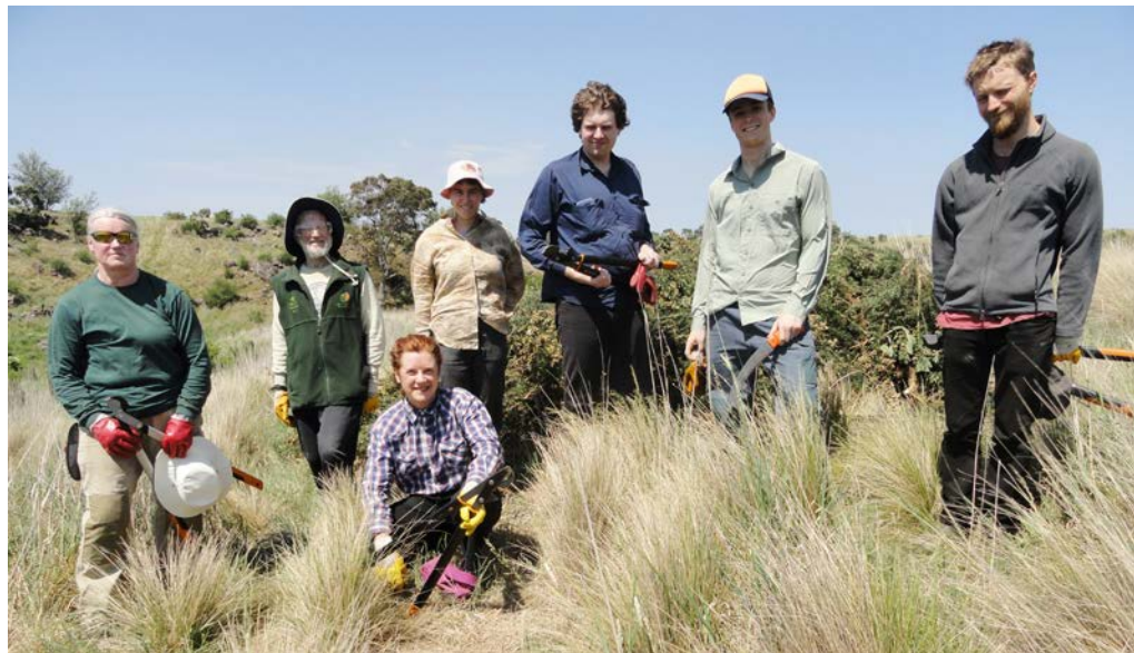
The Woody Weed Whackers at Bababi Marning in October 2017

The Woody Weed Whackers (or 'Impossible Mission' Force) need your help to remove the Gorse, Broom, and Briar Rose bushes from Bababi Marning (Cooper St Grasslands). You too can enjoy the immediate reward of seeing the grassland liberated from woody weeds, and you also get to see the big mob of kangaroos that always show up. Our next activities are on 29 April, 24 June and 23 September.