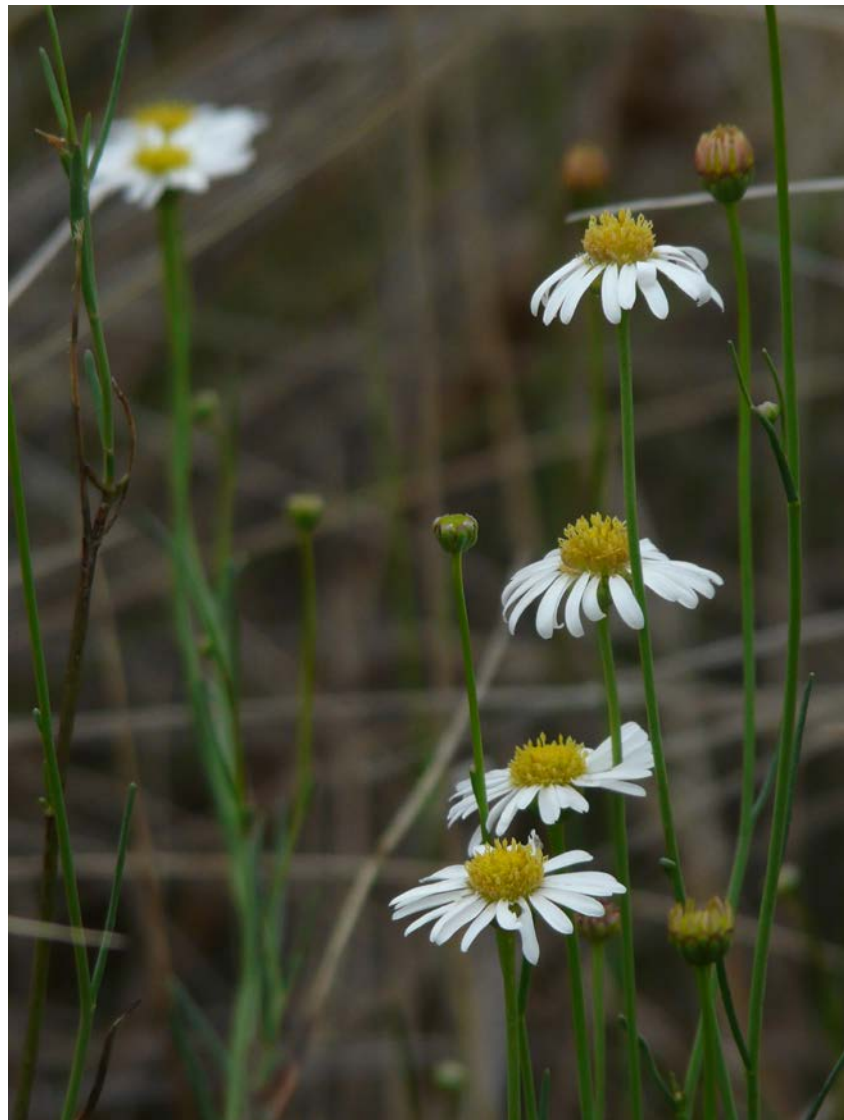
Basalt Daisy ( Brachyscome paludicola ) – one of the "Secret Seven" seeds that we will propagate on this project.

Express your interest: Sounds like you? Please get in touch with Merri Creek Management Committee by emailing admin@mcmc.org.au or calling 9380 8199 between 8am and 3pm.