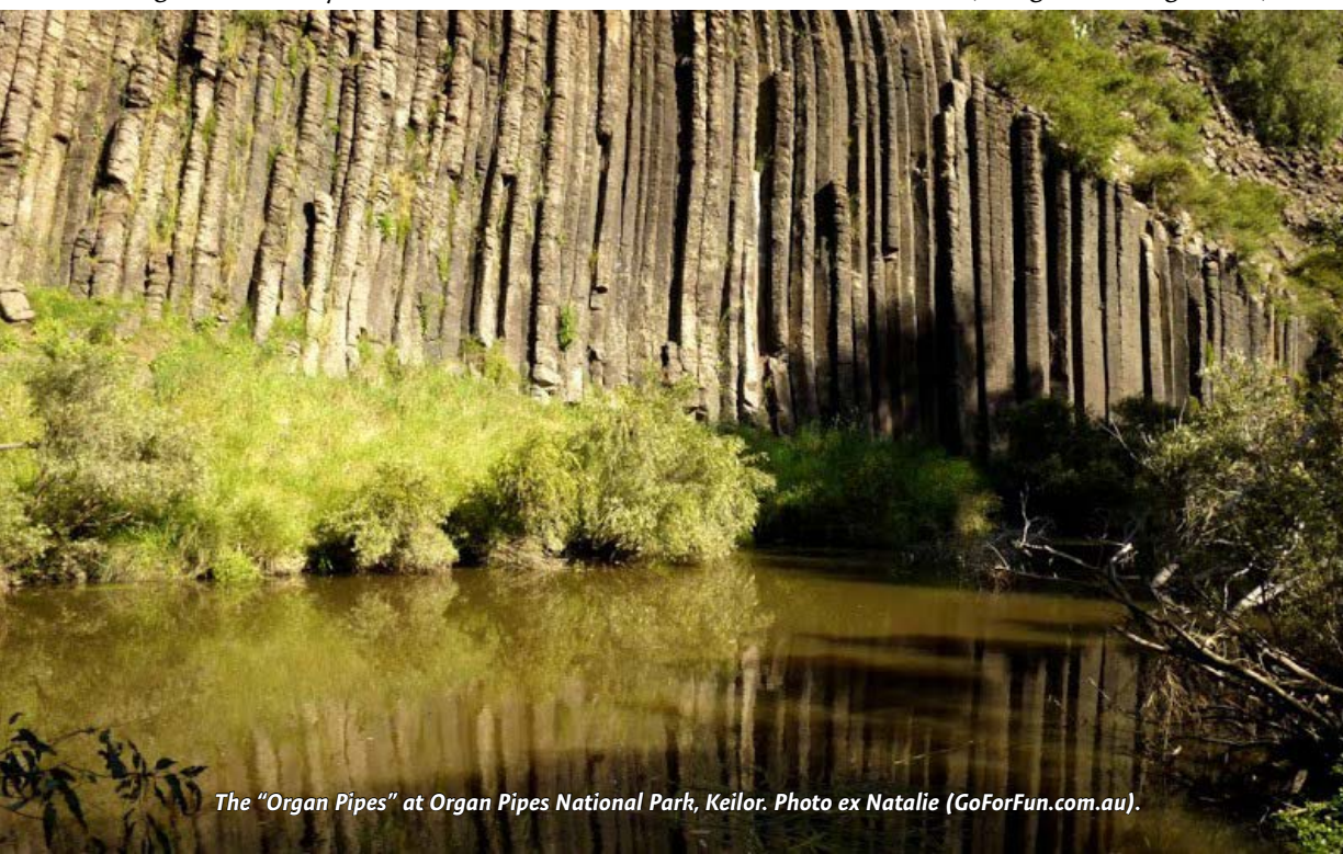
The "Organ Pipes" at Organ Pipes National Park, Keilor.