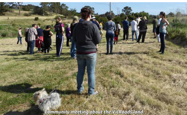
Community meeting about the VicRoads land.

VicRoads land off McBryde St, Fawkner: As reported last year, VicRoads wants to sell 1.7 ha of open space beside Merri Creek in Fawkner, and did a land swap deal with Moreland Council in 2015 that would have allowed townhouse development with only a narrow open space corridor on the Creek frontage. Since the deal became public last year, there has been strong opposition from Fawkner residents and the wider Moreland and Merri