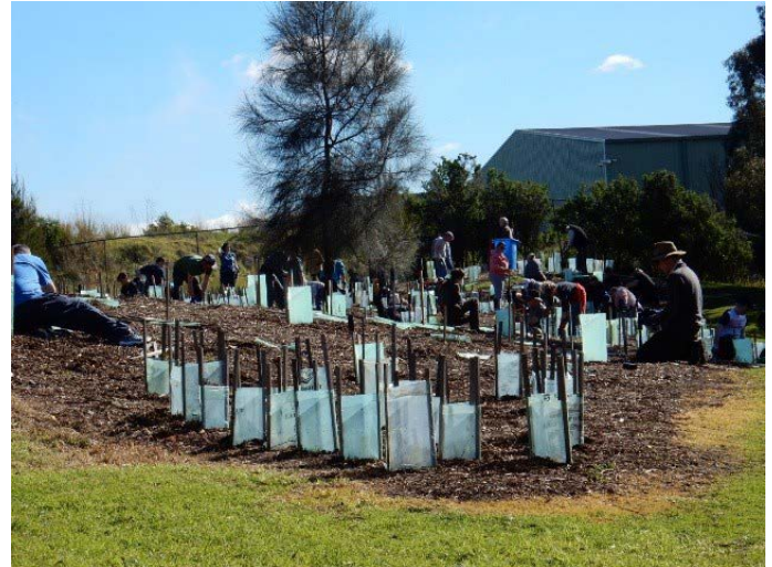
One tree hill no longer! This lone drooping sheoak near the ephemeral water hole/sheoak hill gained a few neighbours this day. I think it was about 800 actually and more will come in 2018. Moreland City Council have mulched a large area on Sheoak Hill and come June and July, two plantings (one FOEC event in July, the other a privately supported event) will continue the transformation.